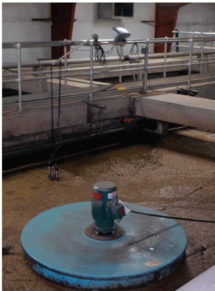
Figure 1: Anoxic Zone with floating mixer (TriOxmatic, VARiON and SensoLyt Sensors in background)

assessment with feedback from the plant operator to determine the type of instrumentation necessary based on the challenges the plant needs to address. As it works through the assessment, the CAU is not partial to any brand of instrumentation, as the CAU will implement whatever is necessary to completely understand issues at the facility.